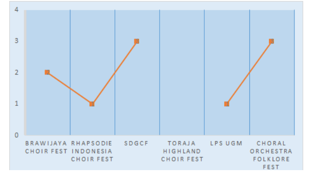
Table 1: Frequency and mode of " Cikala Le Pong " Pong " arrangement.

As presented in the table 1, " Cikala Le Pong Pong " was performed in 5 competitions, but not in The 1<sup>st</sup> Toraja Highland Choir Festival. In the 7<sup>th</sup> Satya Dharma Gita Choir Festival dan the 3<sup>rd</sup> Choral Orchestra Folklore Festival, this song was performed by 3 group-participants. In Brawijaya Choir Festival it was performed twice. In Rhapsodie Indonesia Choir Festival and Lomba Paduan Suara Universitas Gajah Mada, it was performed once. Why is the data important then? It shows that Ken Steven's " Cikala Le Pong Pong " is likely to be performed in the Choir Competitions.