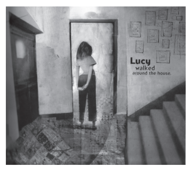
First opening of the book