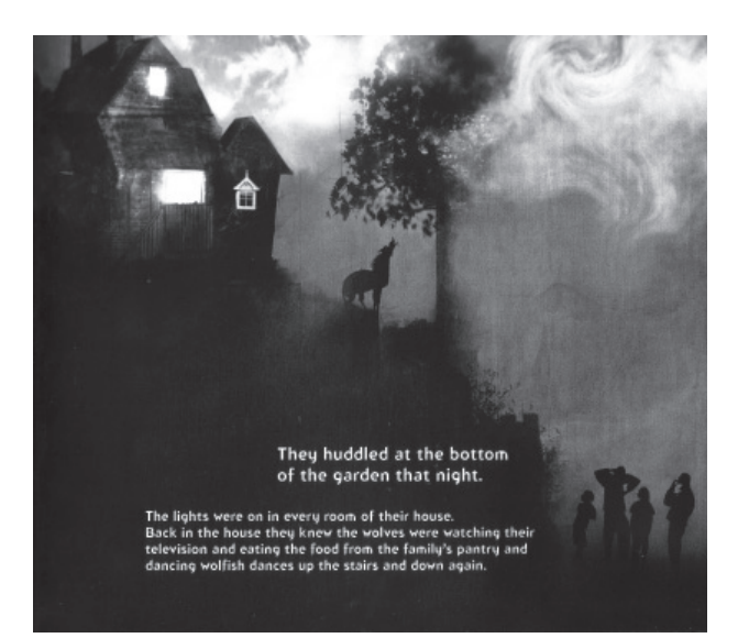
The one of content Illustration of McKean's The Wolves in the Walls

The colour pattern seems to occupy also a special place for children's response towards the images. In another case, the focus of colour pattern even strengthens the fact that children pay attention to smaller details first. The bigger detail such as the colour impression to convey the mood was not given the attention in the first place. This case was found when Caleb responded to a spread when Lucy felt very afraid of the wolves. The pale brown palette was used here, with Lucy's gaze demanding attention from the reader, as it is a close-up shot of her facial expression. The predominant colour, however, seem to be ignored by Caleb. Instead, he turned his focus to the red stripes on Lucy's T-Shirt. The focus on red colour might be associated with the fact that red is his favourite colour. When I asked him about the other colours, he pointed at the white stripes and happily screamed because he found a pattern.