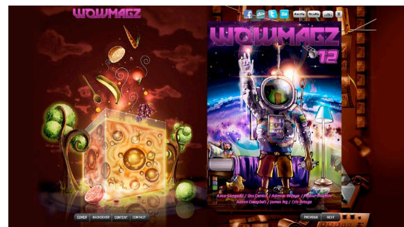
Figure 3 The cover of WOWMAGZ. It use more function buttons than NatGeo

the page using their finger. National Geographic also applies various contents in the publication, from the conventional ones (text and image) to the electronic ones (video, animation / motion graphics). It also includes the links to the other contents like NatGeo website, atlas map, and games.