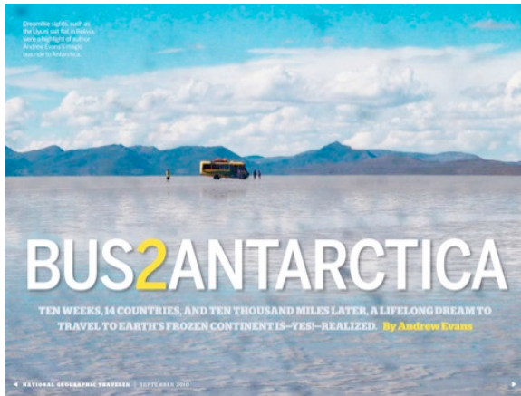
Figure 1 The basic display of National Geographic iPad magazine

National Geographic applies the portrait format, similar to its print version, on the iPad version. The format shows the contents each two pages on iPad in landscape mode.