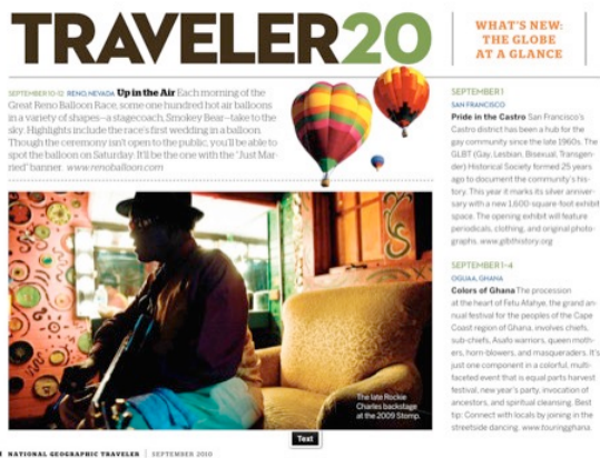
Figure 5 The contents sample page, with orange circles as the clickable links

WOWMAGZ comes with portrait format, with an artistic background as its unique feature, a strong point of the content is the links. WOWMAGZ inputs the links in their articles. For examples, if it is a designer article, it includes the designer’s portfolio website. If it is a collector’s item review, there will be a link to the website. This is a good method for both reviewing and promoting a designer and product.