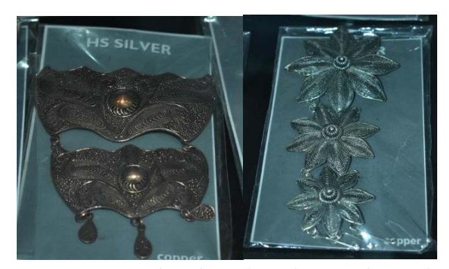
Figure 1. Examples of HS Silver Classic Style Jewelry

In the past, HS Silver Kotagede already had many types of jewelry with traditional styles because it followed the times and had various types.