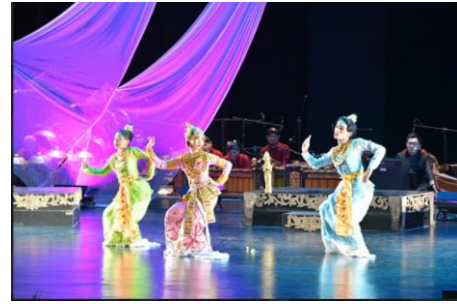
Figure 3. Collaborative performance in Yogyakarta

The Ministry of Education and Culture is also taking advantage of existing relations with the ASEAN Secretariat at the ASEAN PANJI Festival 2023. Along the way, the Ministry of Education and Culture and the countries that will be involved will continue to encourage the ASEAN Secretariat. Through efforts from the ASEAN Secretariat, personal efforts through known networks to follow up on letters sent to the ASEAN Secretariat. These methods produce results. The artists also did this by finding out from letters that had been sent by the Ministry of Education and Culture to the ASEAN Secretariat in each country.