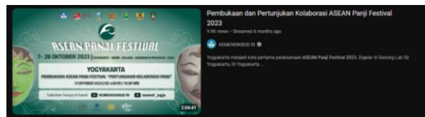
Figure 4. live streaming of ASEAN Panji Festival 2023 in Yogyakarta

The symbolic ceremony indicating that the 2023 ASEAN PANJI Festival has started was carried out by the Director General of Culture, Hilmar Farid. Live streaming is held when the show takes place and this applies to the five cities where the show is held. This is intended for people who are unable to attend the event venue or for all Indonesian people who want to watch the show via their devices. The public can watch live streaming of collaborative performances via the YouTube channels of the Indonesian Ministry of Education and Culture and the Department of Culture of each city, when the performances are held.