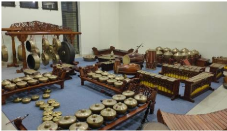
Figure 7. Musician training studio

There are 4 musical instruments brought by Cambodian musicians, this is interesting because it combines musical instruments from Indonesia and Cambodia. For Myanmar itself, there was only one musician and he played a musical instrument from Indonesia because he didn't bring his instrument. Live practice began by first harmonizing musical instruments from Cambodia and musicians from Myanmar who adapted to their own musical instruments.