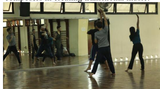
Figure 6. Dancers training

Rehearsals in Yogyakarta were held for five days starting from 8 October to 12 October 2023 with three days in the designated practice studio and 2 days at the event venue later, and there was a grand rehearsal on the day of the event but it was held in the morning until the afternoon. On the first day of practice, October 8 2023, when all the delegates had gathered at the ISI Yogyakarta dance department hall, the first performance was held. In this case, there are eight scenes that have been instructed in advance to each country. This was done to see how far the preparations between each country have been, starting from cohesiveness and harmony with the music, as well as what needs to be improved and also to help the role of dance synchronizers and composers in creating transitional music.