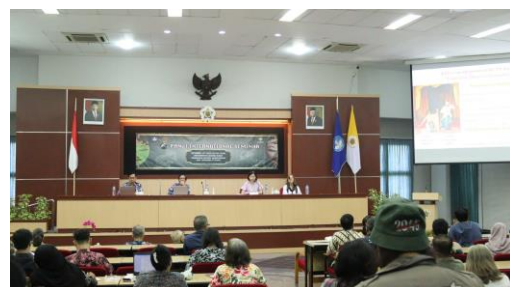
Figure 2. Panji International Seminar in Yogyakarta

Audiences who wish to take part in the seminar are directed to fill in the registration link first. The target audience for this seminar is academics, cultural researchers and the general public. There are invited guests who are invited to attend the event.