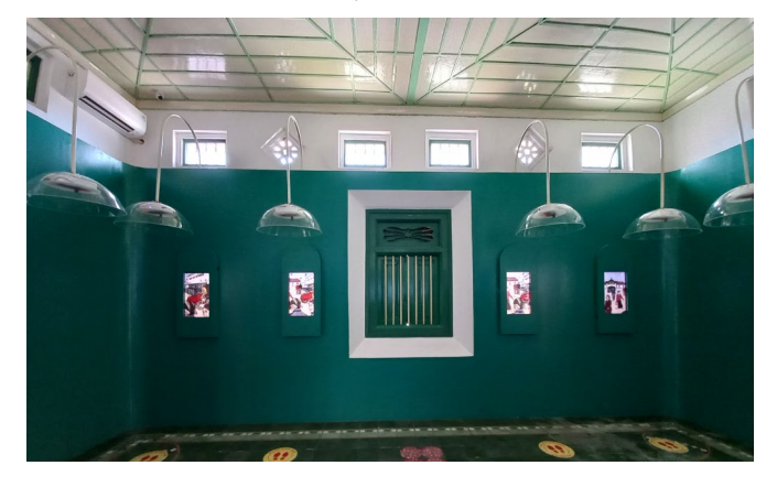
Picture 11. Supporting visual elements Doc. Kanisa Triyundari Arselant, 2023

Supporting visual elements usually have relationships and complement the objects exhibited or stories told by curation (Susanto, 2016, p. 201). Kotagede Museum, in completing existing stories or information, is supported by using supporting visual elements such as interactive media; it provides video playback in the form of video mapping, animated videos and documentaries on monitors, tablets or through smart TVs equipped with sound sensors.