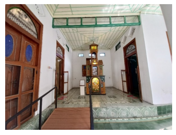
Picture 13. Literature, Performance, Tradition and Daily Clusters Doc. Kanisa Triyundari Arselant, 2023

The Literature, Performance, Tradition and Daily Cluster has a room area of 102 m<sup>2</sup> and has a U-shaped room design with a white cube room type. The circulation of visitors in this cluster is of the corridor type because it uses one gandhok room, which is then partitioned into four rooms in one flow of collection presentation space. These four spaces are culinary space, connecting room, performing arts and traditional customs, literature, and everyday life.