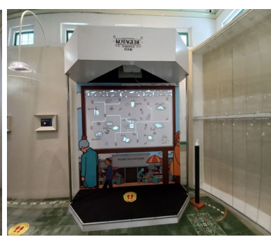
Picture 14. Parade and Magic Wall Doc. Kanisa Triyundari Arselant, 2023

The display technique and composition of works in this cluster predominantly use video media to display collections with intangible patterns packaged in documentary videos, animated videos in the artwork "Parade", and interactive media in the form of "Magic Wall". This parade is an art object collection made to resemble the building of a Kalang house, then Magic Wall to display typical images of Kotagede using touch sensor technology. Therefore, it requires a panel with a height of 3 meters to install video media and leave 1 meter so as not to cover the vents. In addition to using video media, there are four pieces of spanram to display puppet collections, with technical nailed to the wall, and there are two glass showcases measuring 106 cm high and 148 cm wide used to arrange collections of books and objects from the Mataram Kotagede Mosque.