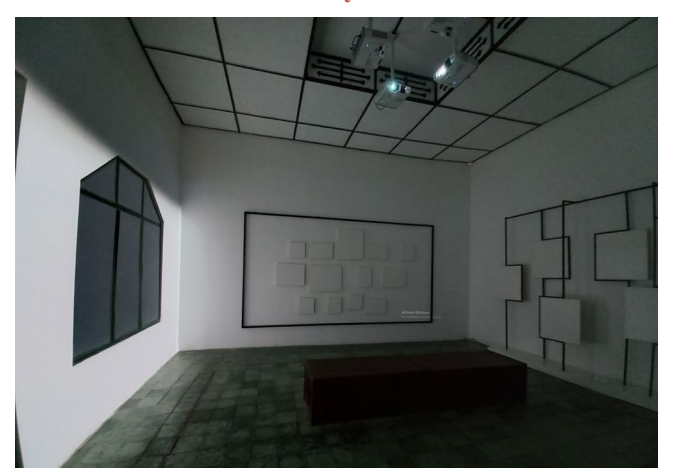
Picture 20. Social and Community Movement Cluster Doc. Kanisa Triyundari Arselant, 2023

The Social and Community Movement Cluster has an area of 36 m<sup>2</sup> and uses only one room painted white or a neutral type of room (white cube). This cluster has an equilateral square room design with arterial patterned visitor circulation. However, this circulation focuses more on video mapping, which is played sequentially and in a circle following every corner of the space because this space does not have any collectibles.