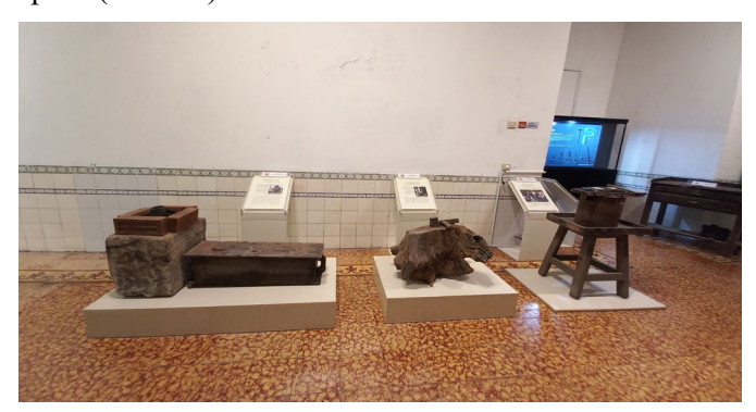
Picture 17. Collection pedestal Doc. Kanisa Triyundari Arselant, 2023

Architecture and Proficiency Traditional Technology Clusters uses two separate rooms: the gandhok room (indoor) and the gadri room (outdoor). These two rooms form a L-shaped room design and have different 55 m<sup>2</sup> and 40 m<sup>2</sup> areas. The circulation of visitors in this cluster is free because in the gandhok room and in the gadri room, visitors can freely see the desired collection. There is no partition in both room. This is because the gadri room has the concept of open space (outdoor).