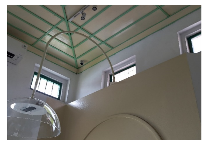
Picture 4. Distance between panel and ceiling Doc. Kanisa Triyundari Arselant, 2023