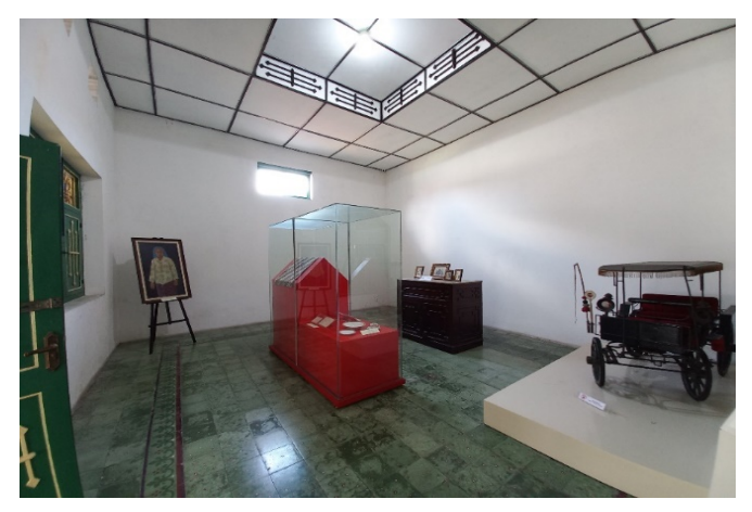
Picture 3 . Types of white cube room Doc. Kanisa Triyundari Arselant, 2023

In an exhibition, two kinds of spaces are usually used according to the needs of the exhibition, namely white cube nuances and natural space. The white cube is agreed upon as a metaphor that presents unlimited space, maybe not cubes, and does not have to have white walls (Susanto, 2016). Natural space is associated with a space left by its owner without any objects being taken away by him. The space or museum displayed today differs significantly from the previous conditions (Susanto, 2016).