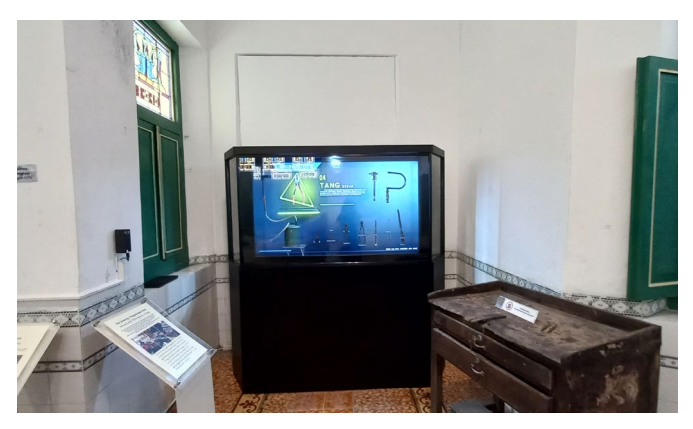
Picture 19 . Vitrin with touch technology Doc. Kanisa Triyundari Arselant, 2023

This cluster has a storyline that is against technological patterns that show progress, especially in the field of craft or the creation of a craft. Technological materials also prioritize aesthetic elements of artefact products or buildings in Kotagede (architecture). Kotagede has several patterns of traditional technological proficiency that have developed since the period of the Islamic Mataram Kingdom, among others: architecture and construction materials and silver crafts.