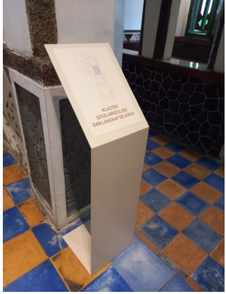
Picture 6. Works labels and Group text Doc. Kanisa Triyundari Arselant

The labels in the Kotagede Museum have three types presented. The first type uses cream-coloured paper, inserted into the acrylic holder model V and placed landscapeally at 5x20 cm. The second type uses cream-coloured paper that is attached to the collection object. The paper is only laminated by clear plastic measuring 5x20 cm. Finally, the third type uses a floor-standing model measuring 40x25x88 cm. This collection label model is made of iron and uses an acrylic touch on the label's top. The label contains a brief and detailed description; then, a collection name uses Indonesian and Javanese script.