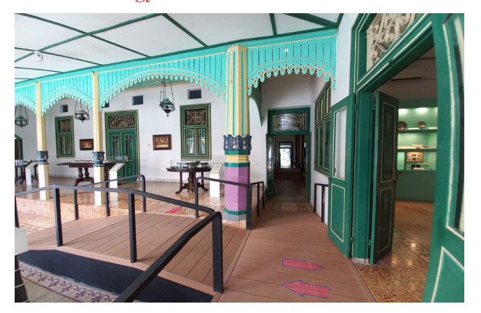
Picture 16. Architecture and Proficiency Traditional Technology Clusters. Doc. Kanisa Triyundari Arselant, 2023

Architecture and Proficiency Traditional Technology Clusters uses two separate rooms: the gandhok room (indoor) and the gadri room (outdoor). These two rooms form a L-shaped room design and have different 55 m<sup>2</sup> and 40 m<sup>2</sup> areas. The circulation of visitors in this cluster is free because in the gandhok room and in the gadri room, visitors can freely see the desired collection. There is no partition in both room. This is because the gadri room has the concept of open space (outdoor).