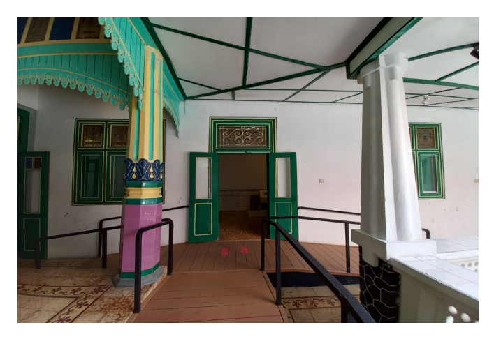
Picture 10. Ramp facility for accessibility