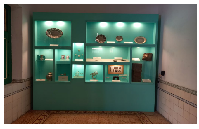
Picture 18. Vintrin silver handicraft collection