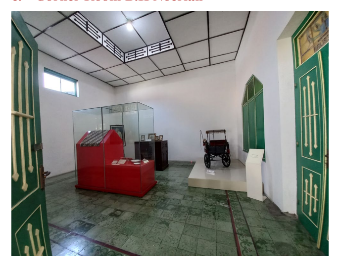
Picture 21. The corner room B.H. Noeriah Doc. Kanisa Triyundari Arselant, 2023

The corner room B.H. Noeriah has an area of 36 m<sup>2</sup> and uses only one white cube room. This cluster has an equilateral square room design with arterial-patterned visitor circulation because visitors can immediately see collection objects in one glance, and visitors are led to see collections directionally.