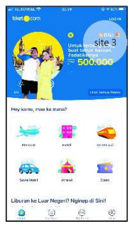
Fig 2. Object of research (Site 1, 2, and 3)

b. Design-related quality: (1) Simple-ness of appearance when interacting with travel sites' visuals. How simple is it?; (2) Ease of use when interacting with travel sites' navigation. How easy is it to navigate?