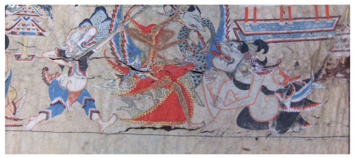
Picture 2. Damage to the Wayang Beber Wonosari reel. It can be seen that several parts are folded and torn. (Indiria Maharsi: 25 July 2011)

purposes which has been going on for several centuries has caused damage to the scroll. Even the colors in the picture have almost all faded, especially in the parts that have quite a lot of folds. The condition of damage to the puppet reel can be seen in Picture 2.