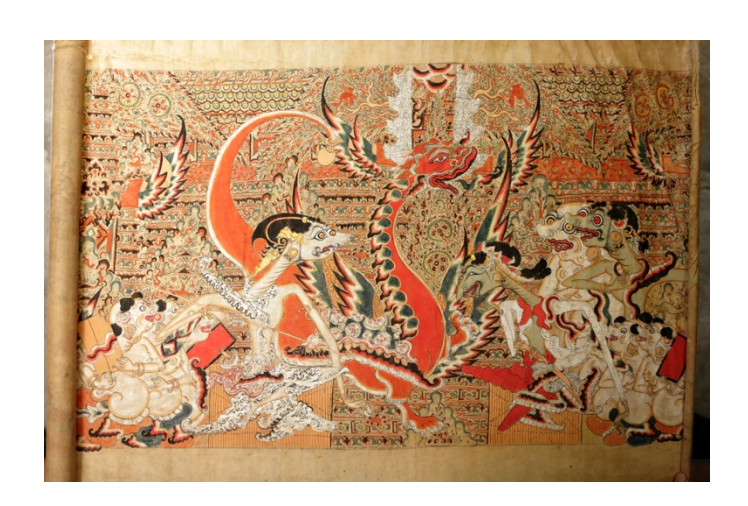
Picture 5. Original image of Wayang Beber Jaka Tarub which uses a duplicate reference

Besides mayang duplication, this community service program also aimed at designing the visual and verbal contents that would be placed on popular social media platforms, such as Instagram. The resulted contents