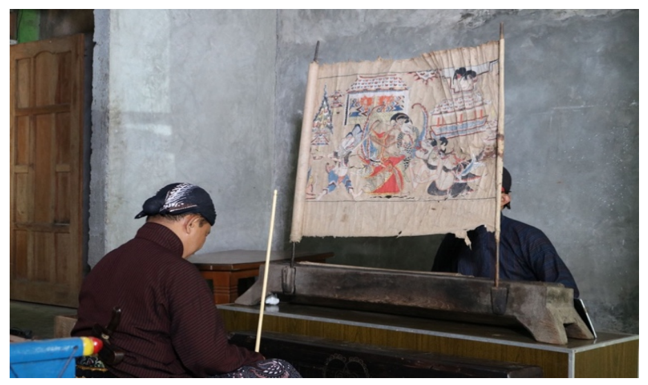
Picture 1. Beber Wayang Performance in Wonosari Yogyakarta. The puppet roll is spread out and stuck in a wooden box which is used as a place to store Wayang Beber scrolls (Kadek Primayudi: 15 December 2019)

However, unfortunately the condition of the wayang reel is no longer perfect. Several parts of the wayang scroll looked torn, folded, dusty, and some parts are even missing, especially on the top and bottom sides of the reel. Opening and rolling for performance