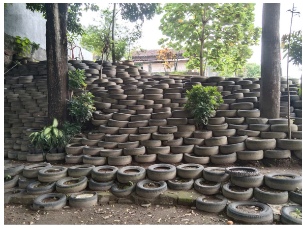
Figure 3. An example of photo stimuli that depicts environmental elements.

those depicting detailed environmental elements (3 photos).