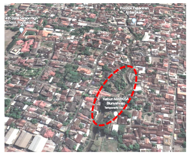
Figure 1. Map of Karangwaru Riverside.

The Buntung River, which flows through Karangwaru District, is one of the rivers that runs through the urban area of the special region of Yogyakarta. Before it was improved, the river was a source of environmental problems in the area. The polluted water carried garbage and unpleasant odors that disturbed the people living along the river. (Figure 1)