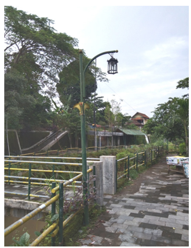
Figure 4. An example of photo stimuli that depicts detailed environmental elements.

The results of the analysis showed several discursive construct findings which consisted of several discourses. These constructs were the results of conversations and processes of social interaction that were formed from the social structure that surrounded them, and these include the followings.