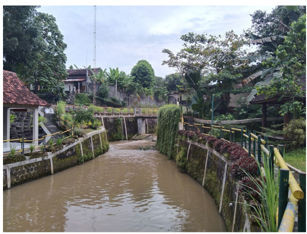
Figure 2. An example of photo stimuli that depicts the environment of a river and riverbanks in general.

With regard to the research methods, photo elicitation was used to stimulate conversations and capture discourses about the KRS development that were being discussed. There were 20 photos that were presented to the respondents. All of these photos depicted environments or sceneries, and they were categorized into three classifications. These three classifications were comprised of general environmental views consisting of 5 photos, photos depicting environmental elements (12 photos), and