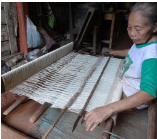
Figure 5. Gedog weaving activities by a woman in Tuban.

Like the weaving gedog tradition that exists in Tuban, it does not have values that are contrary to the rules and philosophy of life of the local community. However, its complex process can be a strong reason why traditions are abandoned and replaced by new traditions that are able to produce similar products without being constrained by complicatedness and long lead time.