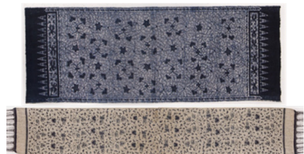
Figure 2. Design of Jarit (top) and Sayut (bottom) Unique to Tuban. Source: Heringa, 2010.

Traditional Tuban fabric designs are made to adapt to the usage of the fabric. The main usages of fabric for Tuban people are as a sayut (shawl cloth wrapped around the shoulder to carry goods) and jarit (a cloth covering the body by wrapping it around from the upper chest to the ankles). Until today, the design of sayut and jarit has never changed in terms of shape and size. The shift occurs in the choice of material by not using gedog batik woven fabric for sayut and jarit , but using printed- batik fabric. This is because the weaving