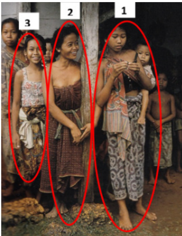
Figure 6. Cloth as an indicator of identity and social status in a community.

Figure 6 shows three Tuban women wearing the original batik jarit made by the Tuban community. The jarit worn by the woman number 1 indicates that she comes from a high social status family. In addition, the woman is wearing a dark blue camisole top while carrying her child behind her using a printed batik cloth. The second woman (number 2) comes from a family with low a social status; she wears gedog woven fabric to wrap her body and protect her chest using only one piece of cloth wrapped around her body. The young woman