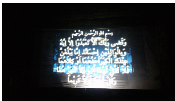
Figure 3. A display of Al Qur'an text in TWS stage.

After reciting a Qur'an verse which becomes its basic story, it continues to drama scenes. The performance of drama scenes is actually an adaptation of text book and a book which tells Salman Al-Farisi story. Besides, some hadist and content of Barzanji books are strengthening message of its historical story. Barzanji is a book which praises the prophet Muhammad. Its content is used to depict a figure of the prophet Muhammad as told again by Salman Al-Farisi and his companions at the end of the story. The drama scenes of Salman Al-Farisi are using multimedia packed in a such way by a director and writer to strengthen a message of the story.