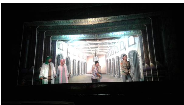
Figure 4. Transculture in TWS performance.

"There is an advice from Kyai, Islam shows Middle-East costume, Middle-East people and then the Kyai said: " enjâ' ta' papa jârèya