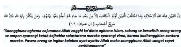
Figure 2. A verse of Al Quran in the opening of TWS story script.

The story of Salman Al-Farisi begins from historical text scattered among many source of literature. Waris collect it and then re-interpret it to be a new creative text which is drama script. An event to transform scientific historical text to creative text is a process of the first adaptation in story of Salman Al-Farisi. In the beginning of Salman Al-Farisi story, it quotes a verse of Al