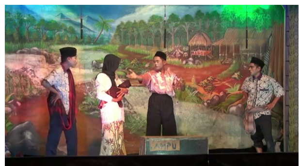
Figure 8. Transculture in the story of Syeikh Maulana Ishaq.