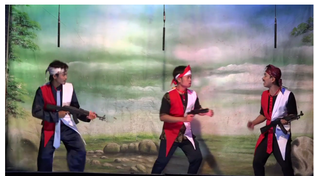
Figure 6. Transculture in TWS performance, characterization of Betawi, Java and Madura.