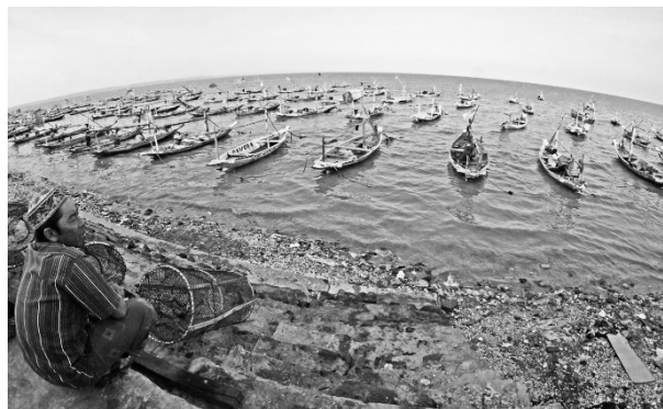
Figure 1: The first photo became material for the Poetry Photo

The process of creating poetry photography is designed and determined by the stages of creation, divided into several main stages of the entire creation process. The first stage of creation is photographing the photo object. Photographing was carried out with various experiments which were the steps of the activities carried out. The steps in the artistic creation process for creating photos include: (1) trying several alternative photo objects that are appropriate and suitable for the expression of the artistic creation being designed, (2) trying several alternative photography techniques that match the expression in the photographic creation, (3) trying several alternatives tools/lighting that match the creative artistic expression being designed, and (4) selecting a visual concept or arrangement according to the subsequent process.