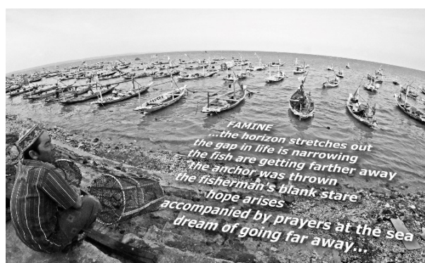
Figure 2: Photo of the poem "Famine" which has been edited as a hybrid work of art

Before it is declared complete, there is of course a review and correction process to ensure there are no spelling errors or incorrect layout. Also ensure that the message you want to convey is clearly visible in the final work. Creation instruments are things used in the creation process. Every artistic creation cannot be separated from several instruments that determine the quality and form of the work created.